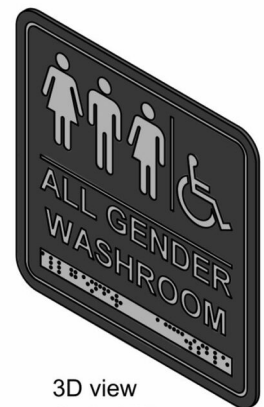
3D view Code 966