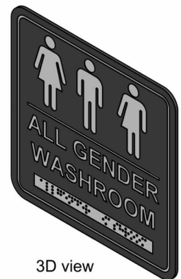
3D view Code 965